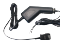
Direct-Wire Power Adaptor 12-24 V DC GA-PA-3