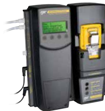
MicroDock II Automatic test and calibration station (see MicroDock II section for additional information)