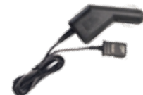
Vehicle Power Adaptor 12-24 V DC GA-VPA-1