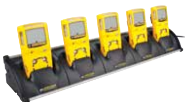
Multi-Unit Cradle Charger MC2-C01-MC5 Simultaneously charges five detectors