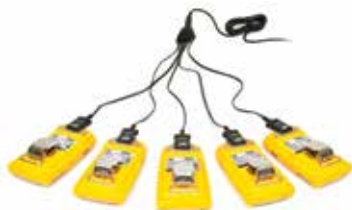
Multi-Unit Power Adaptor GA-PA-1-MC5-NA* Simultaneously charges five detectors

For calibration and testing equipment for this product, please see pages 86-89.