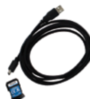
IR Connectivity Kit GA-USB1-IR Use for data download and instrument set-up options