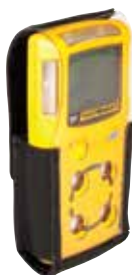
Black Leather PVC Case MC2-LC-1

Note: For complete list of Sampling & Testing Equipment, see the Sampling Equipment section.